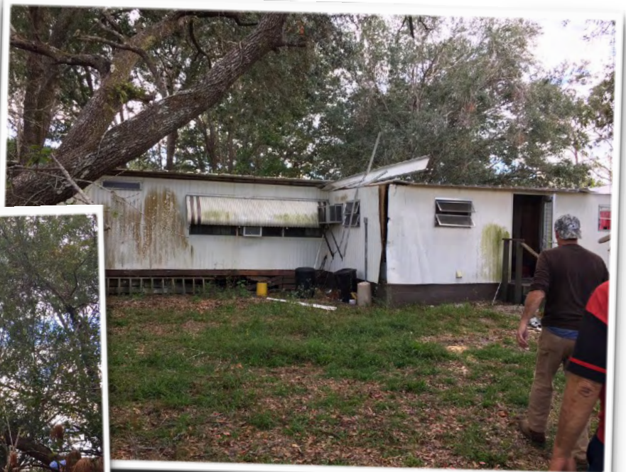
This home belongs to a Korean War veteran whose home lost part of the roof.